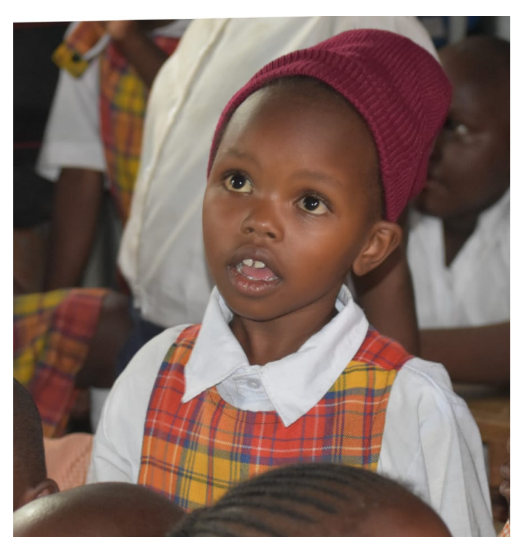
A photo of a student at the Nairobi Education Location.

These church plants have also provided the opportunity for Shelter of Hope Kenya to expand their connections and reputations within the communities. This has resulted in those with needs to reach out to Shelter of Hope Kenya for services.