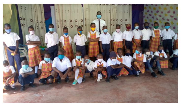
Students at the Nairobi location.