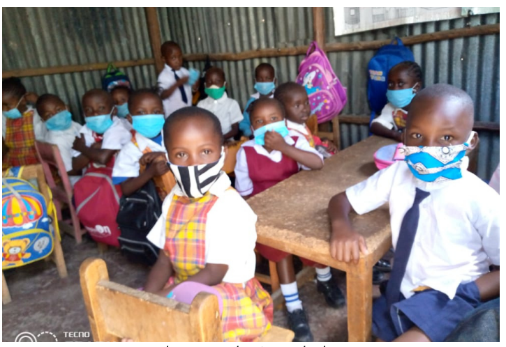
Students at the Nairobi location.

Student sponsorship guarantees children receive quality education plus medical care, nutrition and the message of the Gospel.