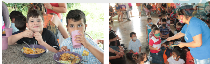
Happy Kids enjoying their Snacks (L), Bibles being handed out to the kids (R)