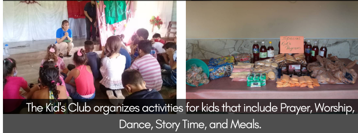
The Kid's Club organizes activities for kids that include Prayer, Worship, Dance, Story Time, and Meals.