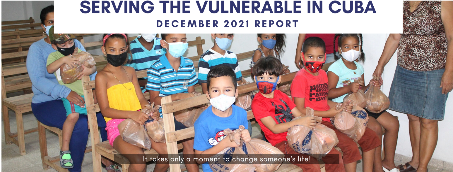
It takes only a moment to change someone's life!