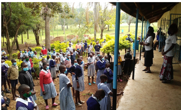
Sanitary pad distribution and teaching

In addition to the Women empowerment program (sanitary pad distribution), KEDHAP is also involved in agricultural efforts, table banking for economic sustainability for the poor, education sponsorships for the vulnerable, relief programs for people living with HIV & AIDS, and other mentoring and community efforts.