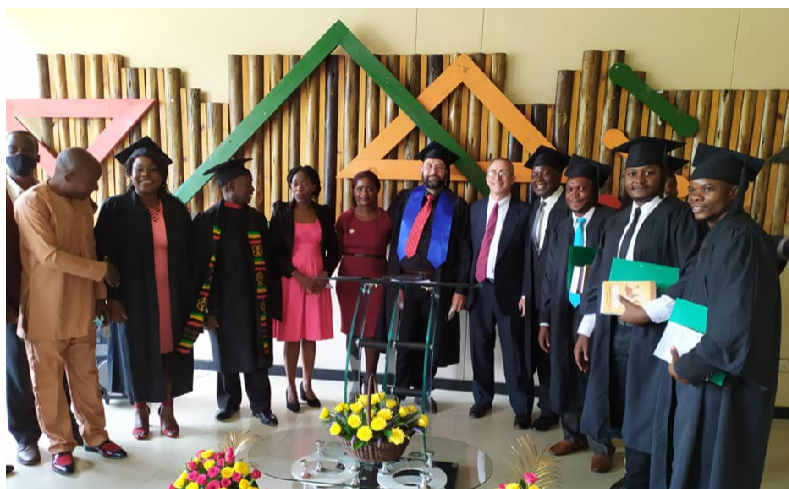
Graduating Class of 2020

https://missionaryventures.ca/thegraceproject