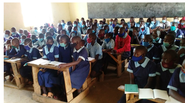
The challenge of social distancing in Kenyan schools

A Girls Health Program was started with an aim of retaining girls in school and to improve their class performance. This is done through provision of sanitary pads and underwear as well as having sessions with the girls about their health and improved hygiene practices. There have been tremendous results from this program throughout the years as the percentage of girls staying in school and completing secondary school in the area has increased from 6% in the 1990's to 84% presently! They now serve over 4000 girls per month. Many girls have been able to achieve their dreams since this program started! But now, due to COVID-19, it is unknown how many of these girls will go back to school once the schools re-open.