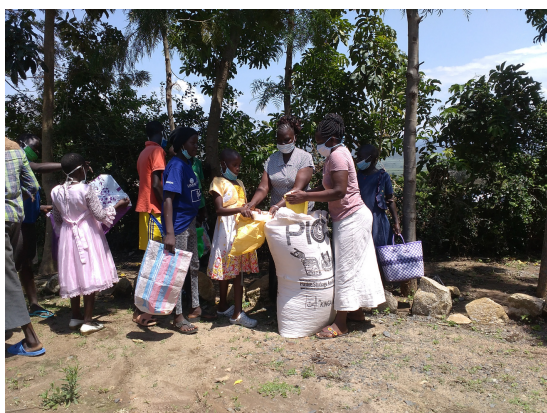
Food Security for People Living With HIV & AIDS

Through a divine appointment, MVC connected with a project in Kenya called KEDHAP. After months of discussions with the Kenyan board as well as their Canadian supporters, KEDHAP officially became a part of MVC in October 2020. KEDHAP (Kenyan Economic Development HIV and AIDS Program) is an effort in western Kenya in Kisumu County. While the AIDS epidemic was devastating western Kenya in the 1990's, a group of indigenous Kenyan Mennonites felt called to reach out in Christ's love and compassion to help their suffering and dying neighbors, comforting them, caring for orphans and widows, and encouraging other church people to join their mission. With almost no money and very few resources, they demonstrated both commitment and faithfulness in using all their resources entirely for their neediest beneficiaries and asking themselves the question, "How can I serve, even with no money?"