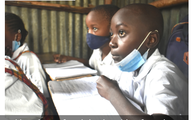
Accessible running water & nutritious food has benefited the health of students.