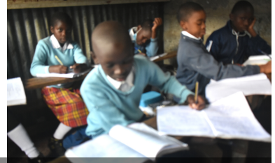
Funds are imperative for Staff salaries and classroom repairs.