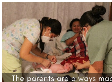
The parents are always made to feel welcomed and loved.