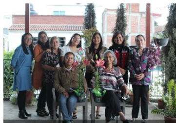
"Our greatest joy, is to serve you!" - 11th Anniversary Celebrations.