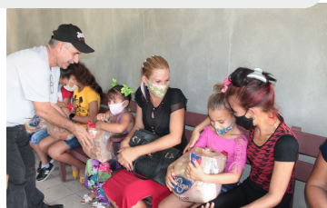
People being blessed with food and supplies at a country church.