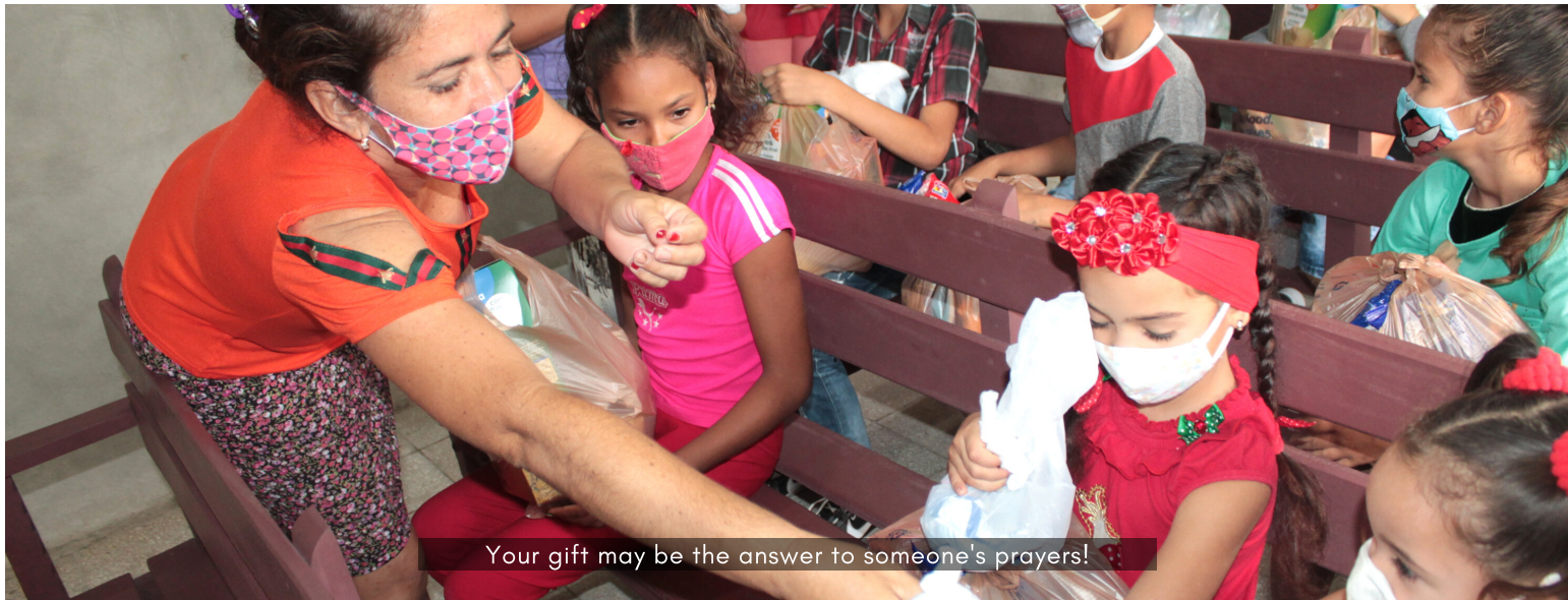
Your gift may be the answer to someone's prayers!