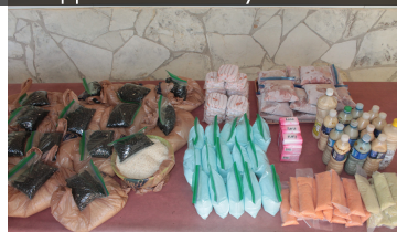
Blessing seniors and the vulnerable with precious food bags and supplies.