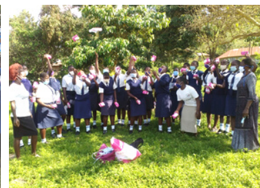
L: Girls of a Secondary School in Muhoroni receive sanitary towels from KEDHAP.