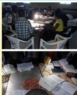
R: Students of N'gombe Satellite School study under two solar lamps.

TGIZ currently has students who are legitimately struggling to pay their student fees.