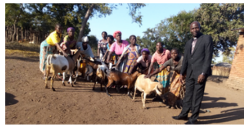
Women Livelihood Upliftment Initiatives