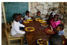
A hot meal at school.