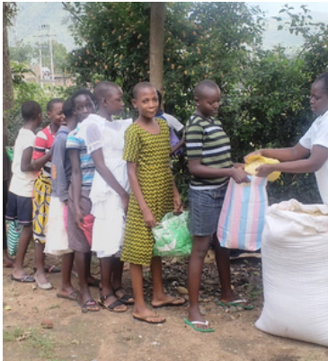
Food support at Ogen Comprehensive Care Clinic

The Kenya Economic Development Human Advancement Project (KEDHAP) is the development, peace-building, and relief arm of the Kenya Mennonite Church in the Diocese of Kisumu East. Thanks to YOUR support, KEDHAP has steadily grown and now serves thousands of participants through a wide range of programs in impoverished rural areas.