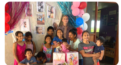
Milestones like birthdays are celebrated so children find healing and hope in their everyday lives.

To Support Tat's Place, visit: www.impacthope.ca/tatsplace