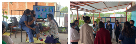
Prenatal attention, exercise, nutrition, and relevant information help expecting couples make informed decisions regarding the birth and care of the baby.

Facilities like Casa Compasiva need emergency transport for referrals, essential drugs, supplies, equipment, and infrastructure, especially physical spaces that are safe and hygienic. Aside from day-to-day expenses like utilities, admin supplies, medical supplies, vehicle maintenance, etc., the Casa is seeking funding for two travel and training programs.