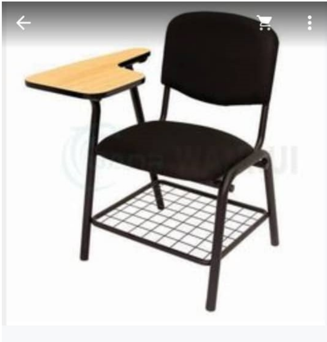
Student chair with side tablet top K1700