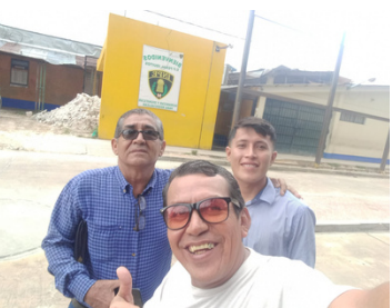
L: Christmas Celebration and Food Drive in Belen R: The team shares the Gospel as part of the prison ministry