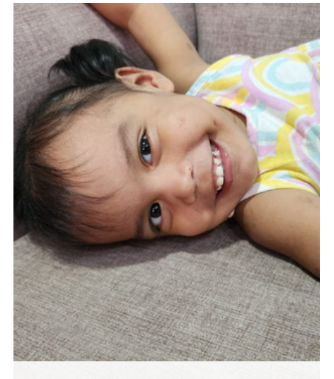
"Hola" from the little ones!