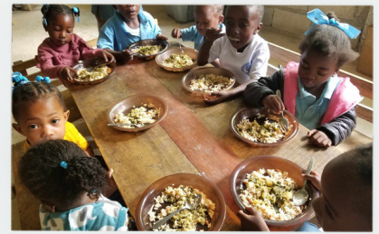
Boosting Learning w/ Nutrition

They're growing up to be smart, strong, and happy kids, all thanks to their teachers and your support.