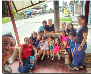
L: A typical Sunday at Hogar Genesis