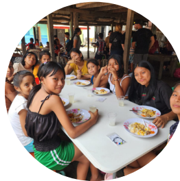
Sharing smiles and meals at new white tables!