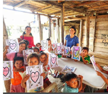
Activities and meals for the kids in Belen