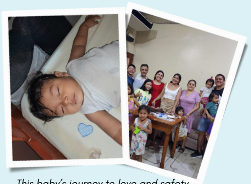
This baby's journey to love and safety begins here.

In certain areas like Belen, poverty, drug trafficking, and gang-related activities make children vulnerable to the perils of their surroundings. Hogar Genesis is a safe haven for the innocent souls caught in the middle of the troubled streets of Belen. Recently, a tiny eight-month-old boy lost his parents who were involved in drug dealing and were arrested in the dangerous slums of Belen. He was left with no one to turn to. However, Hogar Genesis extended a compassionate hand amidst the chaos and despair, offering safety, love, and a chance at a new beginning to this innocent child. This story is just one of many that underscore the vital role Hogar Genesis plays in providing sanctuary and hope for the vulnerable children of Belen. With each child they welcome into their family, they strive to create a haven of love and protection, shielding them from the harsh realities of their surroundings.