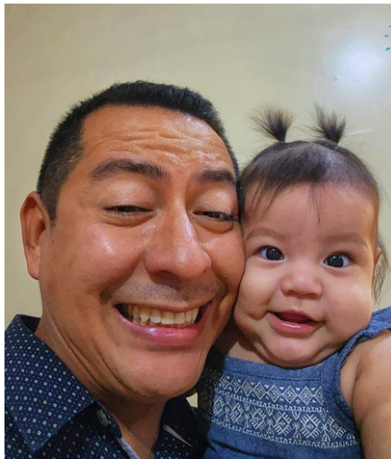
8 months and growing!