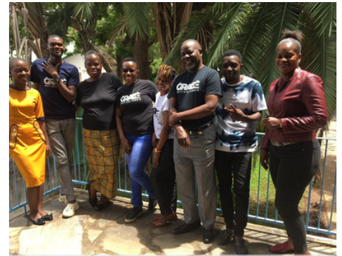
Empowering future leaders, one lesson at a time.