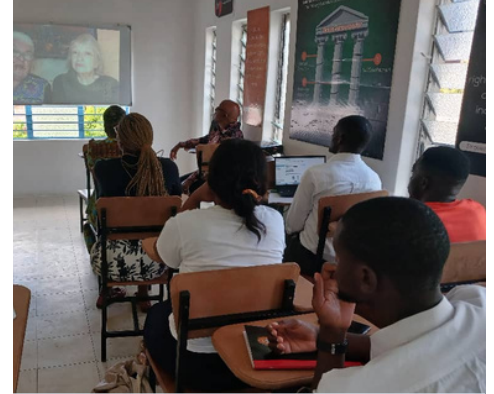
The goal is empower pastors and leaders across diverse communities