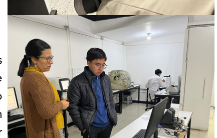
The hospital is committed to compassionate & thorough patient care.

With this new information, the doctor could now treat the woman appropriately. The woman's story is a testament to the hospital's commitment to providing thorough and compassionate care!