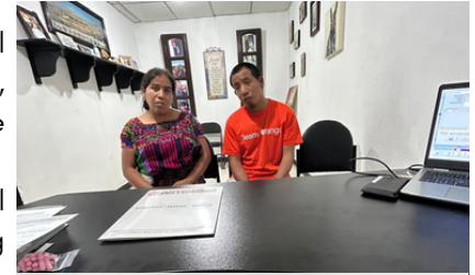
Your support has provided advanced technology, saving lives!

The hospital team quickly arranged for him to start treatment with an oncologist in the capital city. They are grateful to have been able to help him catch the disease early, giving him a fighting chance to recover. Your support has provided the advanced technology and diagnostic equipment , making a huge difference in the lives of low-income patients, and providing them with the care and support they desperately need.