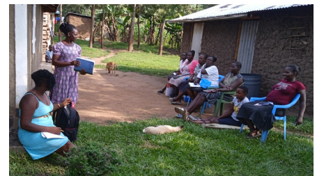
Learning financial skills: Border B members during a simple bookkeeping session.