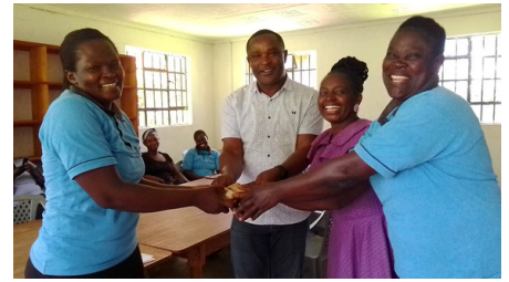
Border B members receive their interest-free loan, empowering them to build sustainable livelihoods.

Thank you, KEDHAP Foundation and ImpactHope, for empowering us and helping us share our story of transformation.