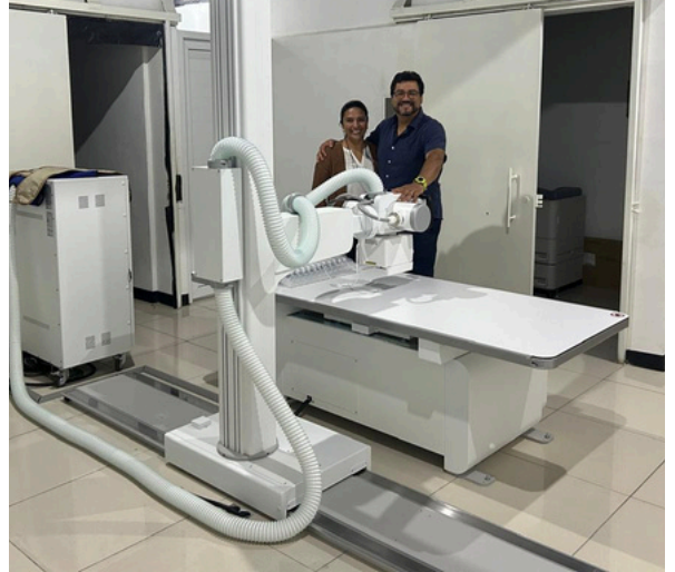
"Grateful for the blessing of our X-ray machine! Thanks to your support, this vital equipment is helping us diagnose and treat patients with precision and care.."

The hospital continues to stand as a testament to what faith-driven service and dedicated partnerships can achieve.